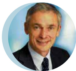
Richard Bruton TD MINISTER FOR JOBS, ENTERPRISE AND INNOVATION