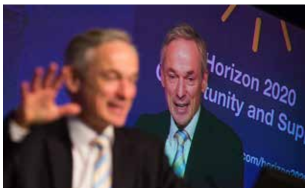
Minister Richard Bruton TD speaking at the H2020 Conference in Dublin.

consortium meetings in Europe. The H2020 Enquiry Service provided information and advice to over 53 individuals and the Horizon 2020 App, which was launched in December 2013, has achieved an impressive 564 users of which 42% are from industry. In addition, InterTradelreland delivered 8 H2020 'Focus On' events and an all-island conference. The objective of Focus On events is to provide opportunities for North South engagement around specific topics in the H2020 programme. As part of the all-island H2020 conference InterTradelreland launched a strategic action plan for H2020. The plan was prepared under the auspices of the All-Island Steering Group and sets out a target drawdown of €175m from proposals with a joint North South dimension.