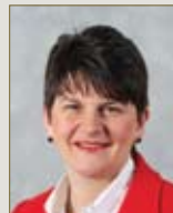
Mary Coughlan TD AN TÁNAISTE AND MINISTER FOR ENTERPRISE TRADE AND EMPLOYMENT

A handwritten signature in black ink that reads "Arlene Foster".